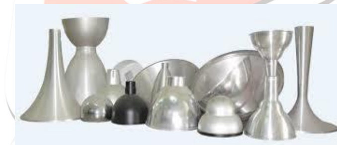
Fig.1. Spinning Component

Metal spinning is one of the oldest method of chip-less formation. Metal spinning is the technique to produce axisymmetrical part or component over rotating mandrel with the help of rigid tool known as roller .During the process both the mandrel and blank rotated while the spinning tool contract the blank and progressively induce a change according to the profile of the mandrel. Spinning process help to produce a lightweight component. The component of metal spinning are cylinders, drums, Domes, hemispheres, cones, cups etc. as shown in Figure.1 .These component are used for domestic purpose, aerospace application , automobile application etc. Over the last few decades, sheet metal spinning has developed significantly and spun products have been widely used in various industries. This method has been developed to reduce the material deformation and wrinkling failure of the spinning process. By using these techniques in the process design, the time and materials wasted by using the trial-and-error could be decreased significantly. In addition, it may provide a practical approach of standardised operation for the spinning industry and thus improve the product quality, process repeatability and production efficiency[1].